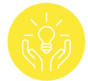
A prosperous Wales

These actions will satisfy the following 2009 Measure Improvement Objectives;