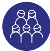
A Wales of cohesive communities