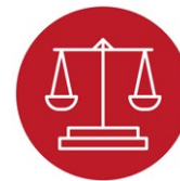
A more equal Wales