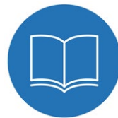
A Wales of vibrant culture and thriving Welsh language