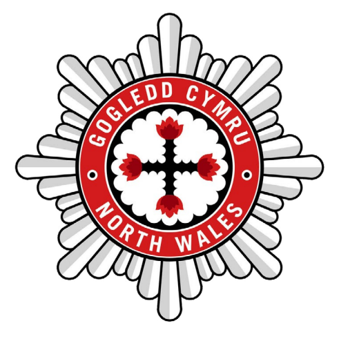
Gwasanaeth Tân ac Achub Fire and Rescue Service