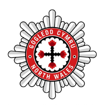
Gwasanaeth Tân ac Achub Fire and Rescue Service

We welcome correspondence and calls in Welsh and English and we will respond equally to both and will reply in your language of choice without delay. Applications submitted in Welsh will be treated no less favourably than an application submitted in English.